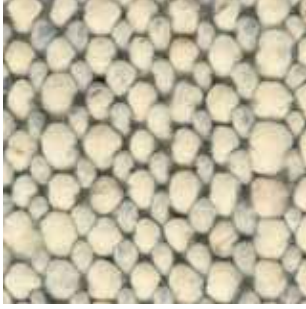
pebbles - cream 1233