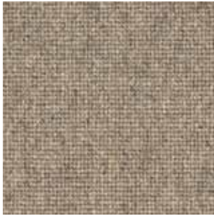
traffic - beige 181